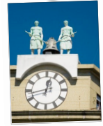
Quarter to one