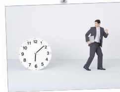
Ten past six