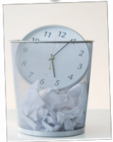
Five past five.